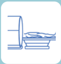
Low Dose CT